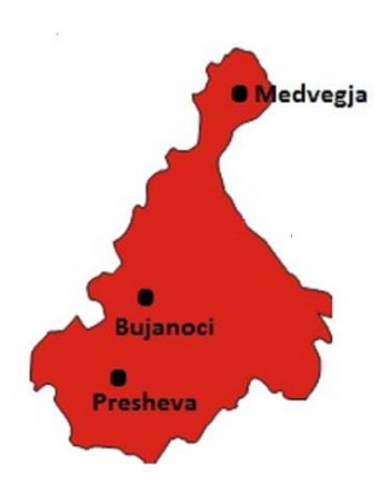
Map of the Presevo Valley 1