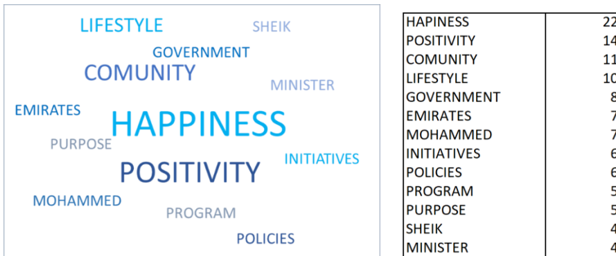
Figure 2 - Frequent words

In summary, a major focus is seen in government policies. Positivity appears with a focus that is very close and complementary of happiness. Of note is 'happiness as a way of life' and the involvement of the private sector in the National Happiness and Positivity Programme. In addition, it was possible to verify that the word 'community' also has a strong presence as can be seen in the following 'cloud' of words obtained (Figure 2).